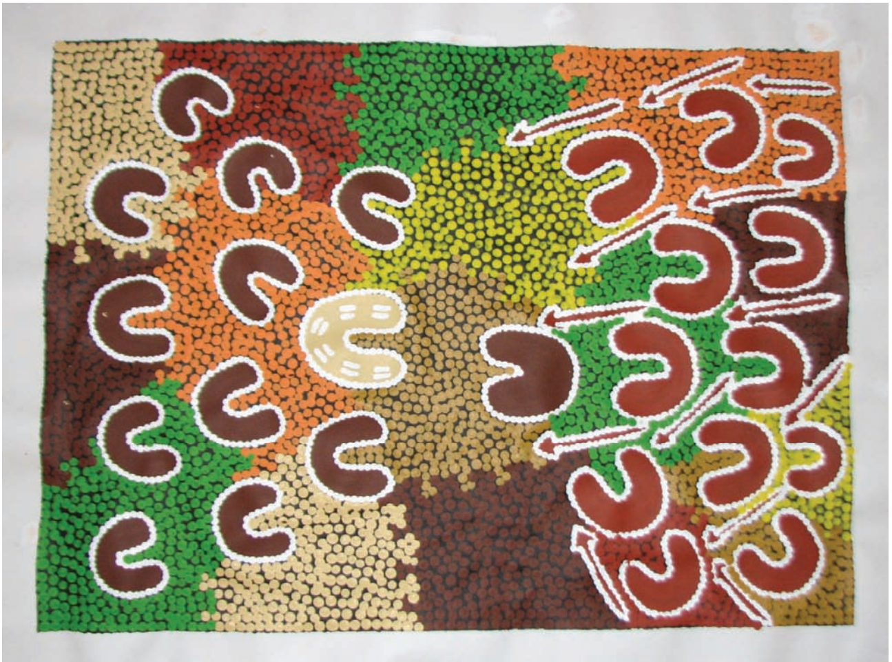
Jesus betrayed by Judas. Judas with the soldiers meeting Jesus and the other disciples