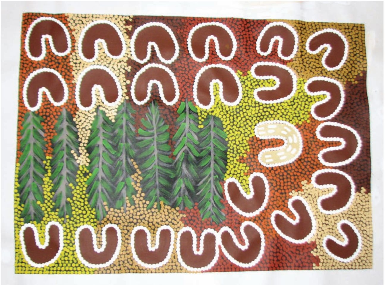
Jesus entering Jerusalem with the people shouting Hosanna and laying down palm fronds